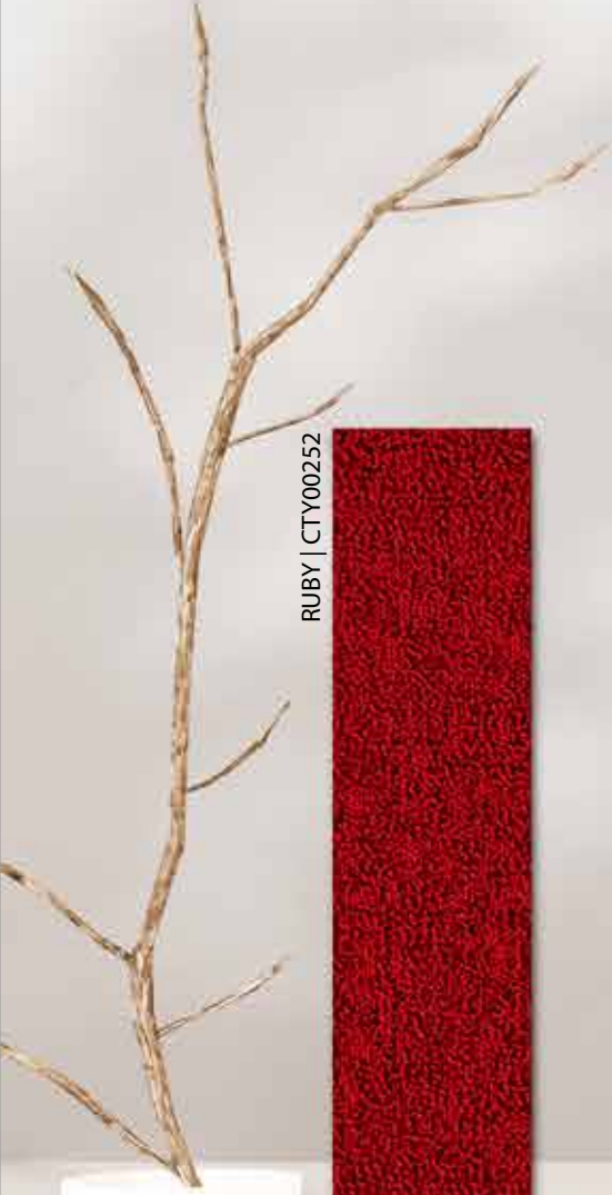
RUBY | CTY00252